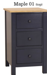
Maple 01 (top) Maple ANB K3-B03 Night Side Stand 18w 19¼d 28½h