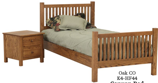
Oak CO K4-HF44 Canyon Bed

Available in: Twin, Full, Queen, Eastern King and Western King