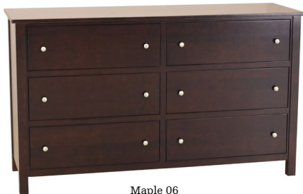
Maple 06 K4-B92 Dresser 62w 19¼d 35¼h