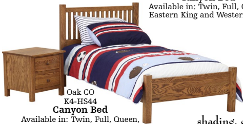
Oak CO K4-HS44 Canyon Bed

Available in: Twin, Full, Queen, Eastern King and Western King