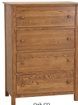
Oak CO K4-B80 Chest 37w 19¼d 49¼h