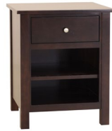
Maple 06 K4-B02 Night Side Stand 20½w 19¼d 25h