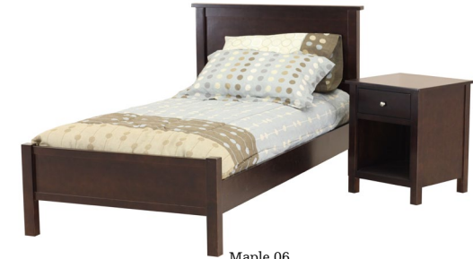
Maple 06 K4-HS84 Meadow Bed Available in: Twin, Full, Queen, Eastern King and Western King

Available in: Twin, Full, Queen, Eastern King and Western King