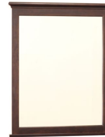
Maple 06 K1-M10 Mirror 31½w 2d 41h