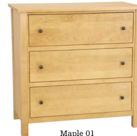
Maple 01 K4-B90 Dresser 37w 19¼d 35¼h