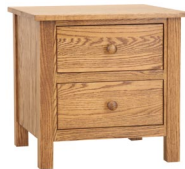
Oak CO K4-B01 Night Side Stand 20½w 19¼d 20½h