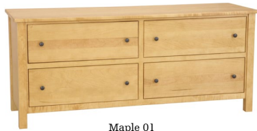
Maple 01 K4-B93 Dresser 62w 19¼d 26¼h