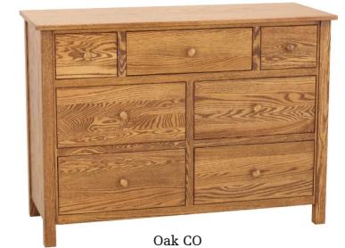
Oak CO K4-B91 Dresser 50w 19¼d 35¼h