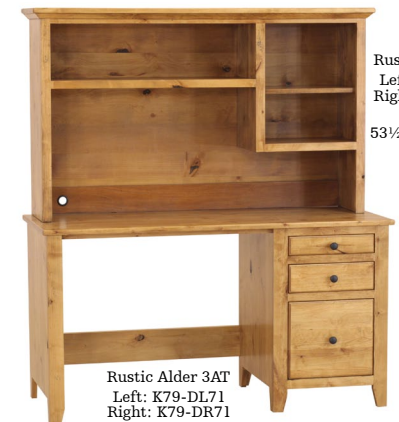
Rustic Alder 3AT Left: K79-DL71 Right: K79-DR71 Desk 54w 21¾d 29h