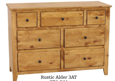
Rustic Alder 3AT K79-B91 Dresser 48½w 18¾d 35h