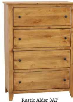
Rustic Alder 3AT K79-B80 Chest 35½w 18¾d 49h