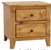
Rustic Alder 3AT K79-B01 Night Side Stand 20½w 18¾d 20h