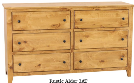
Rustic Alder 3AT K79-B92 Dresser 60½w 18¾d 35h