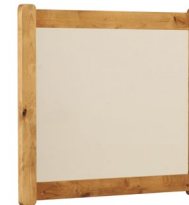
Rustic Alder 3AT K79-M10 Mirror 11w 1d 33h