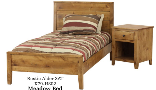
Rustic Alder 3AT K79-HS02 Meadow Bed Available in: Twin, Full, Queen, Eastern King and Western King

All Stuart David products have a multi-step finish. A multi-step finish involves sanding, staining, shading, glazing, and polishing - just to name a few. You can see and feel the protective beauty and choice of many rich colors.