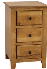
Rustic Alder 3AT K3-B03 Night Side Stand 17½w 18¾d 28½h