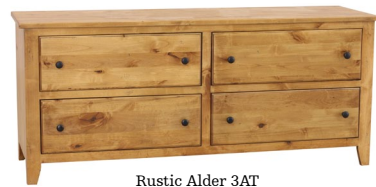
Rustic Alder 3AT K79-B93 Dresser 60½w 18¾d 26h