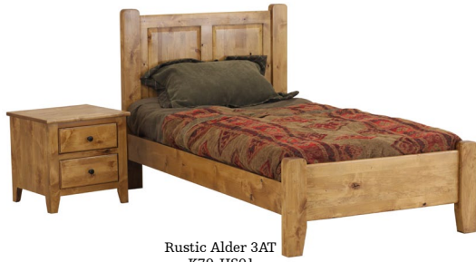
Rustic Alder 3AT K79-HS01 Canyon Bed Available in: Twin, Full, Queen, Eastern King and Western King (also available with taller foot board)