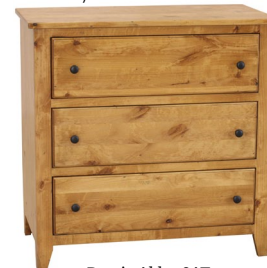
Rustic Alder 3AT K79-B90 Dresser 35½w 18¾d 35h