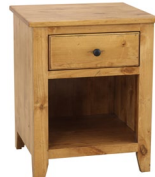
Rustic Alder 3AT K79-B02 Night Side Stand 20½w 18¾d 25h