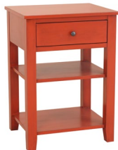
Maple ARC K1-N02 Bed Side Stand 21w 19d 28½h

*Wood grain & color will cause staining variations, which we are unable to warranty*