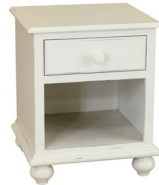
Maple AHP K3-B02 Night Side Stand 21w 18¾d 25¾h