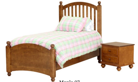
Maple 07 K3-HS381 Valley Meadow Bed Available in: Twin, Full, and Queen

All Stuart David products have a multi-step finish. A multi-step finish involves sanding, staining, shading, glazing, and polishing - just to name a few. You can see and feel the protective beauty and choice of many rich colors.