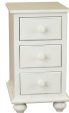
Maple AHP K3-B03 Night Side Stand 16½w 18¾d 29¾h