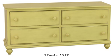
Maple AMS K3-B93 Dresser 61w 18¾d 26¾h