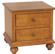
Maple 07 K3-B01 Night Side Stand 21w 18¾d 20¾h