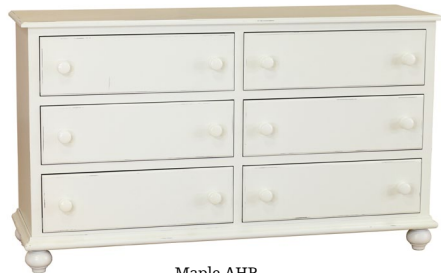
Maple AHP K3-B92 Dresser 61w 18¾d 35¾h