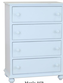
Maple ASB K3-B80 Chest 36w 18¾d 49¾h