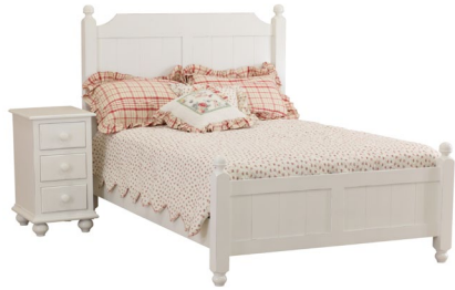
Maple AHP K3-HS319 Valley Home Bed Available in: Twin, Full, Queen, Eastern King and Western King