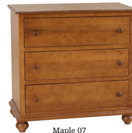
Maple 07 K3-B90 Dresser 36w 18¾d 35¾h