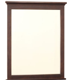
Maple 06 K1-M10 Mirror 31½w 2d 41h