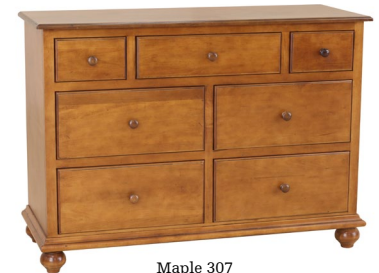
Maple 307 K3-B91 Dresser 49w 18¾d 35¾h